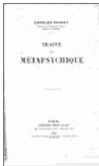
Traité de Métapsychique

Take for example the case of mesmerism, generally presented as coming before spiritualism. While the heyday of the mesmeric movement was over by the middle of the nineteenth century, belief in magnetic action continued into the late nineteenth and the twentieth centuries (Alvarado 2009b, 2009c). This was evident in the writings of philosopher Émile Boirac (1851–1917), who collected his essays in his widely cited book La Psychologie Inconnue (1908). But several others also defended the existence of a magnetic force capable of inducing trance and other phenomena, among them Alexandre Baréty (1844–1918), Hector Durville (1849–1923), and Albert de Rochas (1837–1914) (Baréty 1887, Durville 1895–1896, de Rochas 1887). Consequently, mesmerism was more than a stage taking place before spiritualism. In fact, mesmerism coexisted with spiritualism and with psychical research at different time periods.