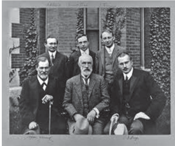
Sigmund Freud, G. Stanley Hall, Carl G. Jung (front row), Abraham A. Brill, Ernest Jones, Sandor Ferenczi (back row), at Clark University in 1909.

Hall was a founder of journals, among them the American Journal of Psychology (1887) and the Pedagogical Seminary (1891). He was instrumental in the formation of the American Psychological Association in 1892 and president of Clark University (1888–1920). Hall created in this institution the first autonomous psychology department in the country, where